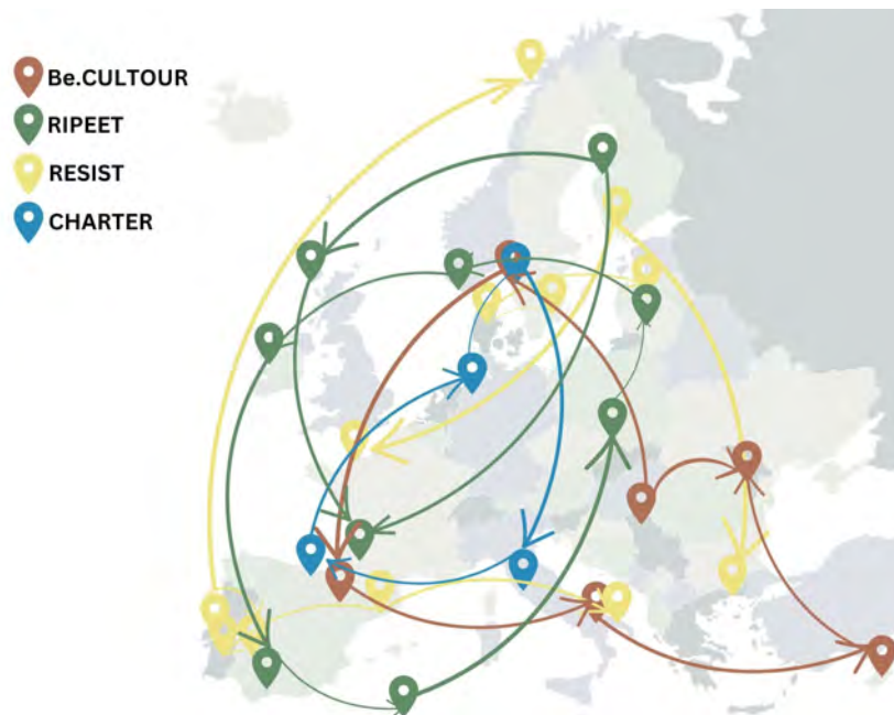
Pilot and twinning regions involved in ERRIN projects

ERRIN has also worked on European projects to demonstrate the value added and impact that an ecosystem approach can bring. In doing so, ERRIN has been able to secure additional visibility and a prominent platform for its members at EU level with concrete opportunities to showcase members' strengths and expertise in strategic areas such as skills development and energy transition. In several projects, pilot and twinning regions, and their innovation ecosystems, are collaborating with peers across Europe, and through increased connections creating a stronger European R&I ecosystem.