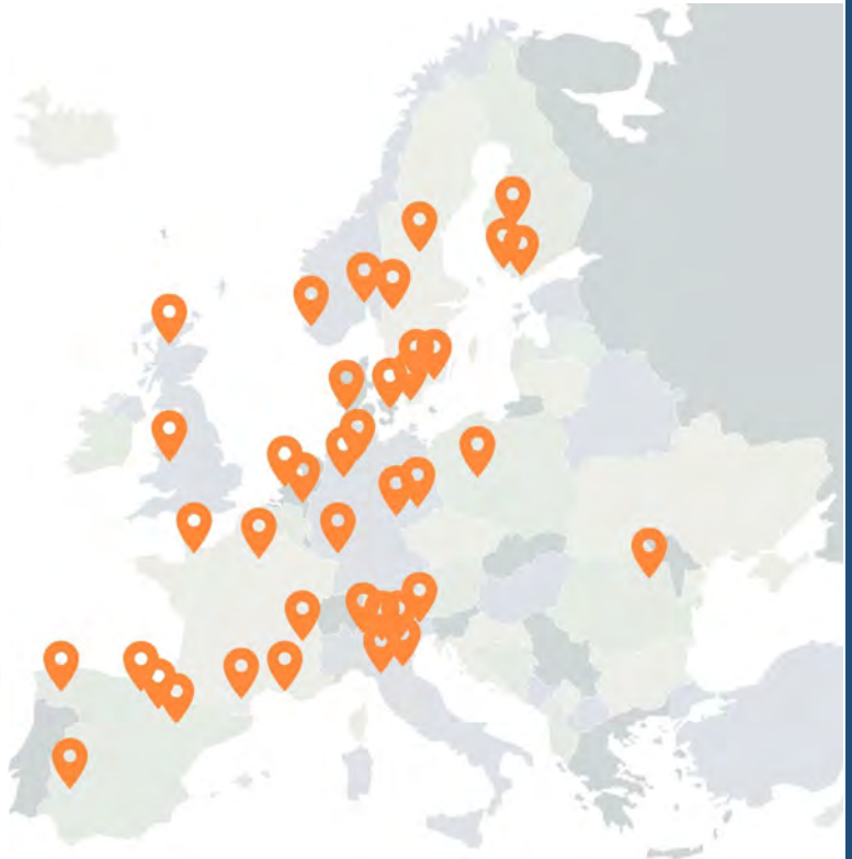
ERRIN Working Groups and Task Forces' leaders