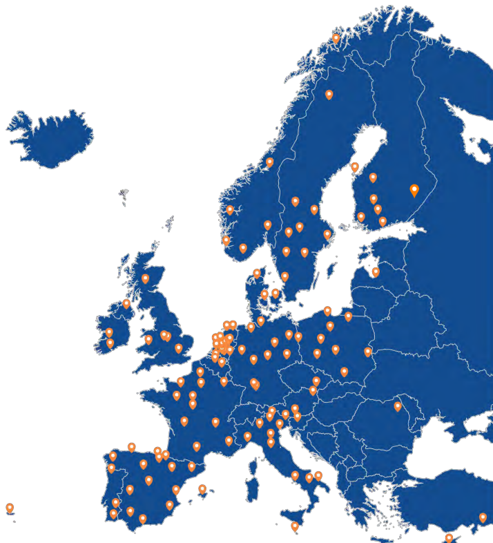
ERRIN member regions and cities