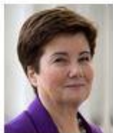
Chair, Hanna GRONKIEWICZ-Waltz